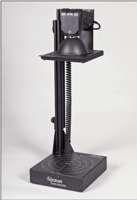
The WCT-120 is an affordable, tabletop silicon lifetime and wafer metrology system, suitable for both device research and industrial process control.

The wafer measurement instrument offering the best available calibrated analysis of carrier recombination lifetime. Fully compliant with SEMI Standard PV-13.